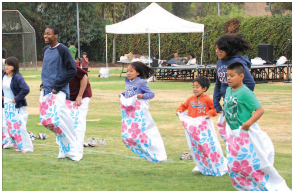
An old-fashioned sack race gets these kids jumping. Other competitions included relay races, egg and spoon races, and hula hoop contests.

Members of the LLU family and local churches also participated in the event, in addition to children from area schools.