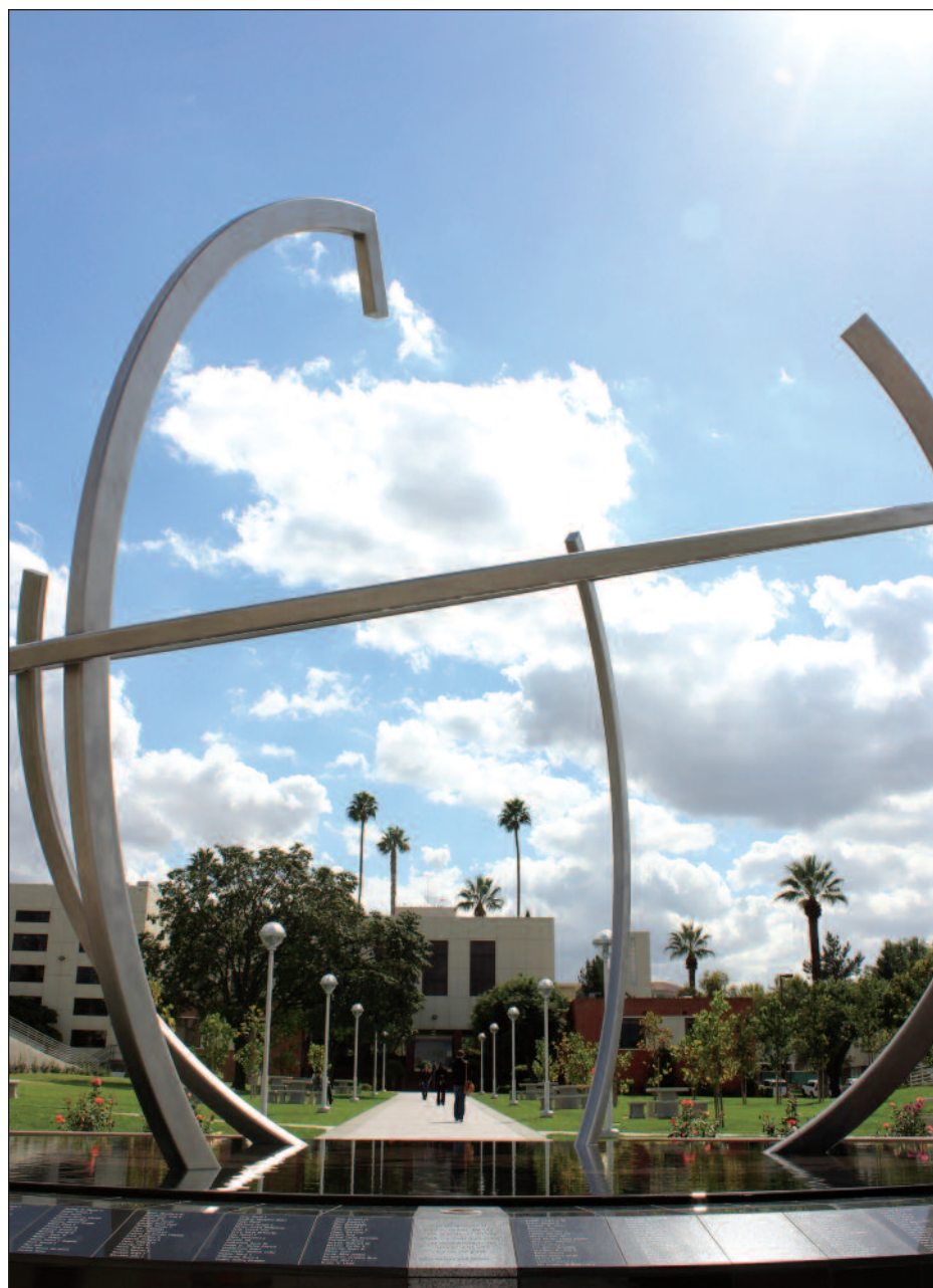
The dedication program for the mission globe took place indoors because of the first significant rain of the season. The sun came out the following day, when this photo was taken.