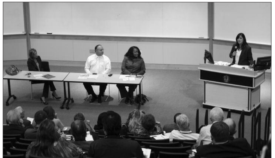
A panel discusses community planning during last year's summit.