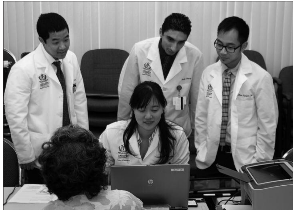
Medicare Part D outreach activities remain an important source for experiential education. Here pharmacy students assist a senior citizen in choosing options.