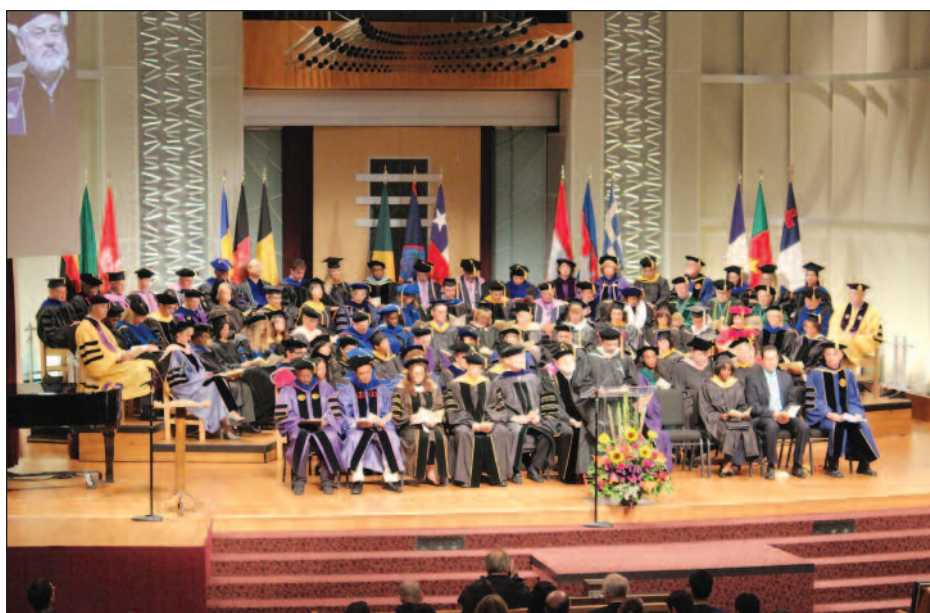
The 2011 Loma Linda University convocation on October 5 was attended by students, faculty, staff, generous donors, and other visitors. The Loma Linda University Church sanctuary was filled to its capacity. A dedication ceremony for the LLU mission globe followed, held inside due to imminent heavy rain showers.