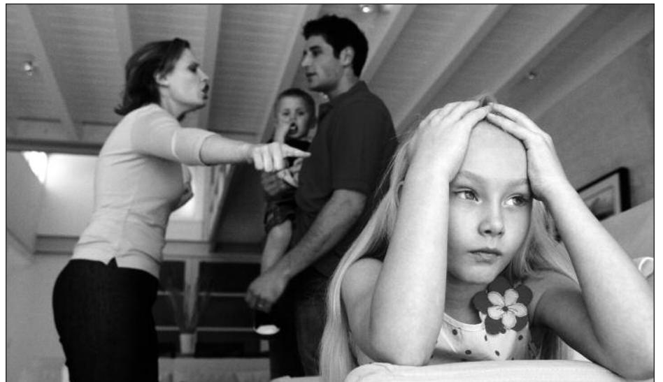
When a situation arises in the home that requires involvement of Child Protective Services, there is often a disconnect between social workers and law enforcement.