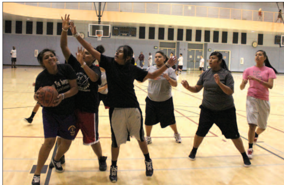
The game gets fun but competitive as girls vie for the ball. Basketball was one of many activities the participants rotated through during the event.